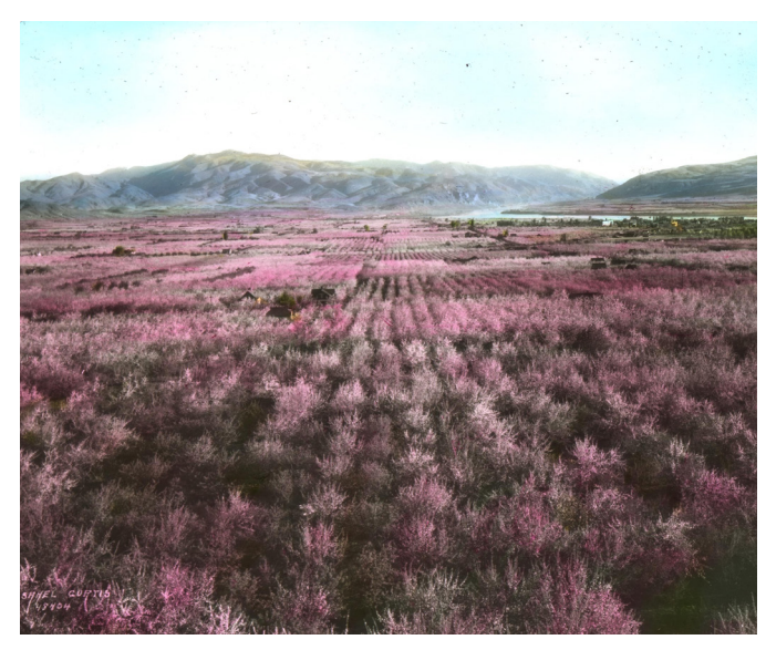
Wenatchee's apple orchards blooming in a 1928 photo by Asahel Curtis. Washington State Digital Archives

In its conservative interpretations, the court