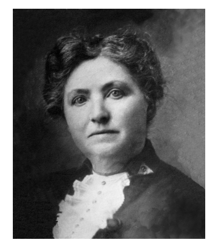
State Rep. Nena Jolidon Croake proposed a daily minimum wage of $1.25 for women in 1913.

Male lawmakers said they disagreed with Croake's proposal to set a specific floor of $1.25 per day for women's pay. Instead they overwhelmingly supported a bill by state Senator George Piper of Seattle that created a state Industrial Welfare