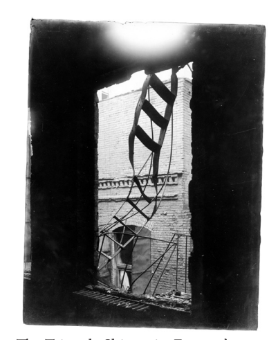
The Triangle Shirtwaist Factory's only fire escape collapsed in a blaze that killed 146 workers and spurred labor reforms.

The Cascadian was part of a growing chain that would become Seattle-based Westin Hotels. An imposing mix of Art Moderne and Beaux Arts styles, it was the tallest