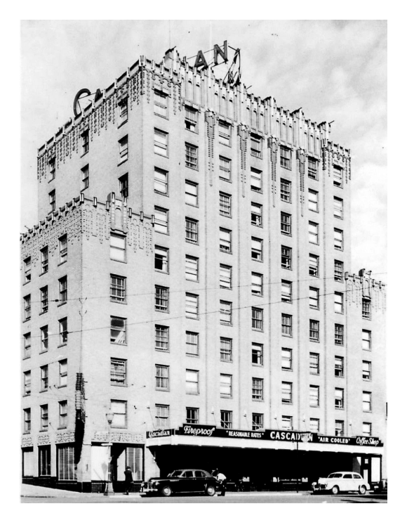
Elsie worked at the Cascadian Hotel on the day of her wedding to Ernest Parrish.

building in Wenatchee, with 184 rooms and amenities such as air conditioning. It remains the city's tallest building.*