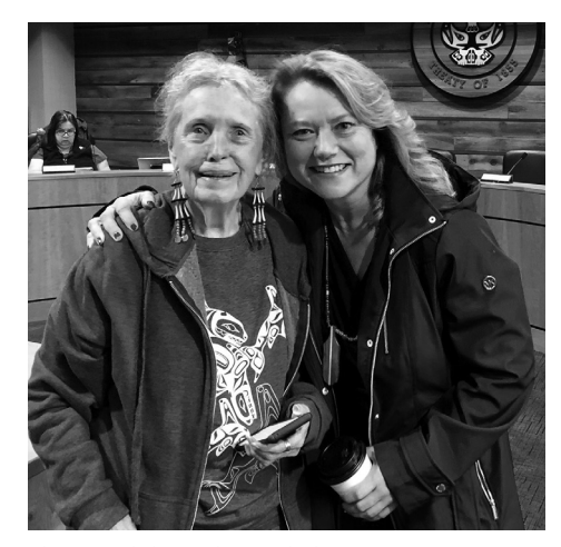
Sharp with legendary tribal activist Ramona Bennett of the Puyallup Tribe in 2018. They helped launch a political action committee to advance public policies that protect the environment and human rights. First American Project

three-story buildings. At least 15,894 people died; more than 2,500 are still missing. Protective seawalls were breached by the first surge. Boats and vehicles were tossed about like Tonka toys; screaming people bobbed in the torrent. Taholah and Queets, already at sea level, would be wiped off the map in seconds. There's a legend among the Chimakum Indians along Hood Canal that they were a remnant of a Quileute band that fled the coast "because of a high tide that took four days to ebb." New scientific research authenticates the stories handed down for centuries by Olympic Peninsula tribes. Tsunamis swept away an ancient Klallam village near present-day Port Angeles every 200 to 500 years, according to a team of researchers from Portland State University, Western Washington University