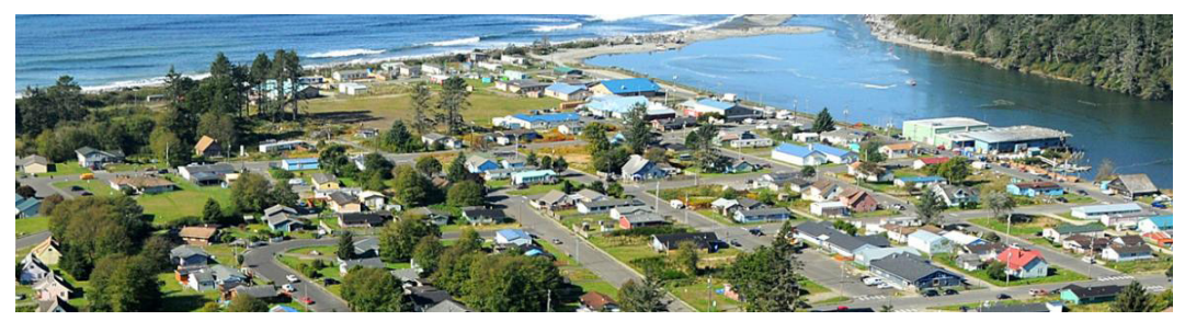
The Quinaults' ancestral village of Taholah is threatened by tsunamis and rising sea levels caused by global warming. Quinault Indian Nation

"The glaciers that feed the rivers and support the salmon that are integral to the Quinault culture and economy are disappearing," tribal scientists say. "Forests on tribal lands are changing, and invasive species threaten critical subsistence resources. Ocean acidification, hypoxia events, sea level rise, coastal erosion, tidal surge and