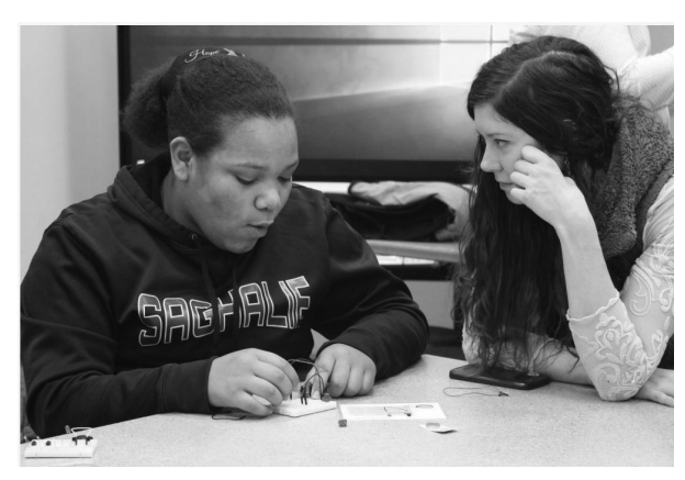
A volunteer helps a student build a circuit at the school TAF runs in partnership with the Federal Way district.

A deal was signed to bring the Academy to a campus of portable classrooms nestled between Totem Middle School and Star Lake Elementary