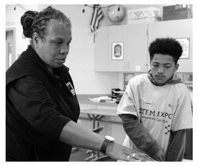
Dziko tells students they need training or education beyond high school, no matter what they want to be. TAF

summers—at no cost to the Tacoma school district. A fiveyear agreement gave both the district and TAF a say in matters such as staffing. The district and TAF plan to use a similar model at Roosevelt Elementary School.