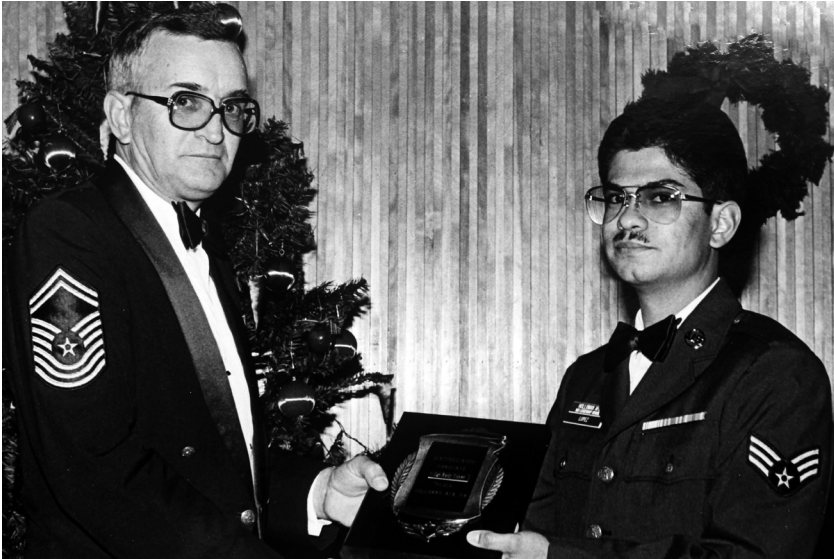
A young sergeant receives a leadership award.

them every night and get ready for his quiz the next day. You learned what worked and what didn't. You learned the dosages and all the potential side effects. You became a walking encyclopedia of the PDR (Physician's Desk Reference book)."